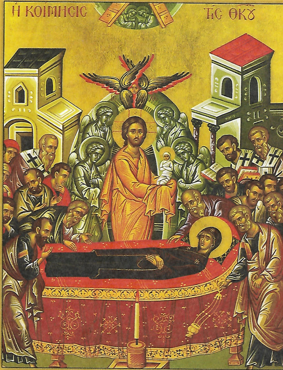
Icon of the Dormition of the Theotokos