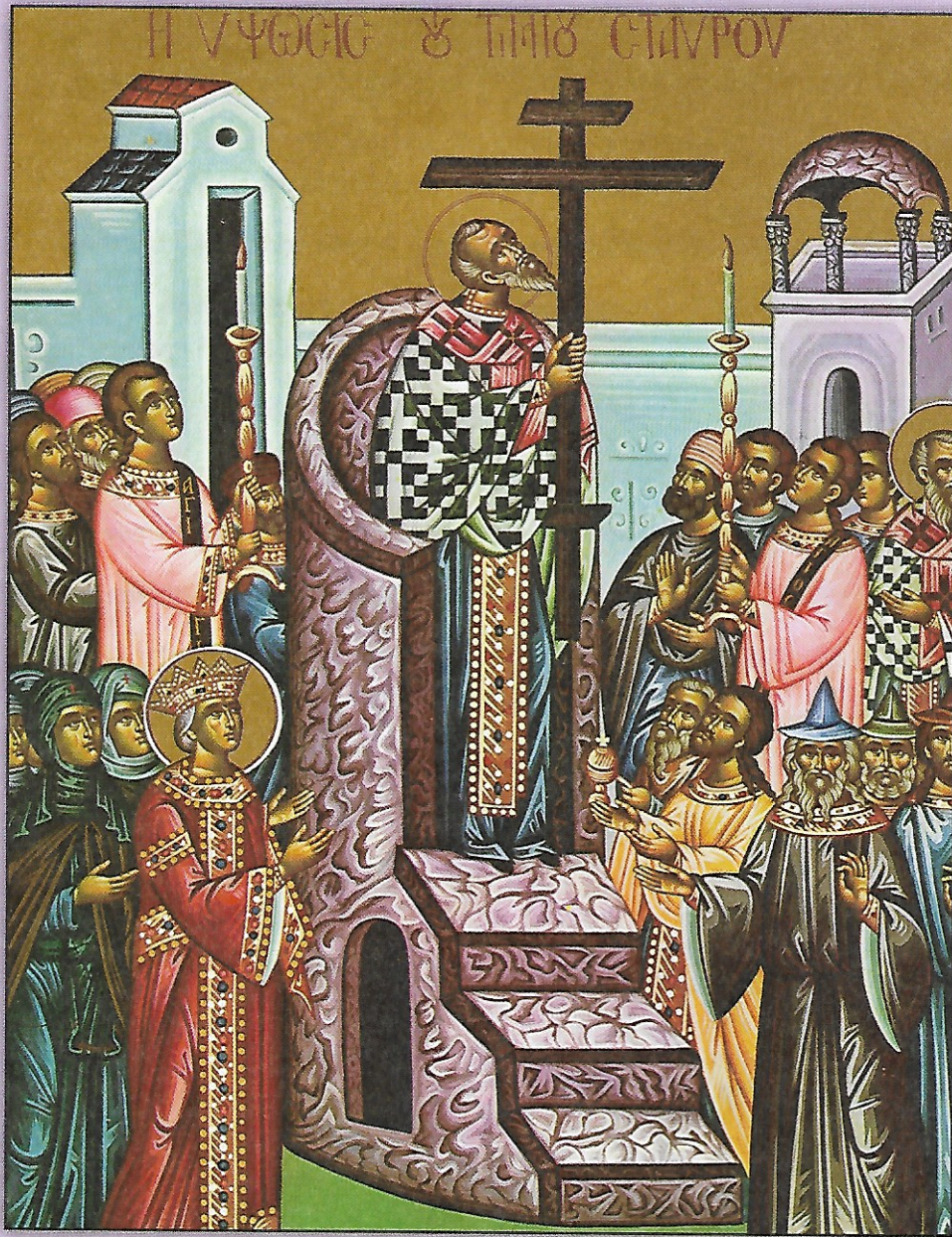
Icon of the Exaltation of the Holy Cross -- September 14th