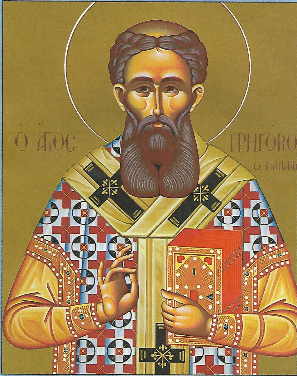
Icon of Saint Gregory Palamas