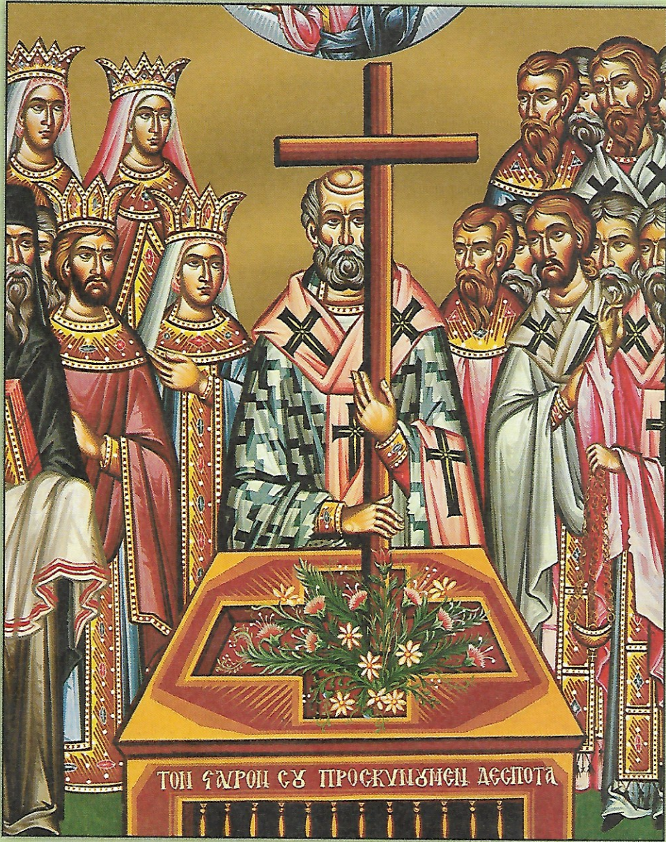
Icon of the Exaltation of the Holy Cross