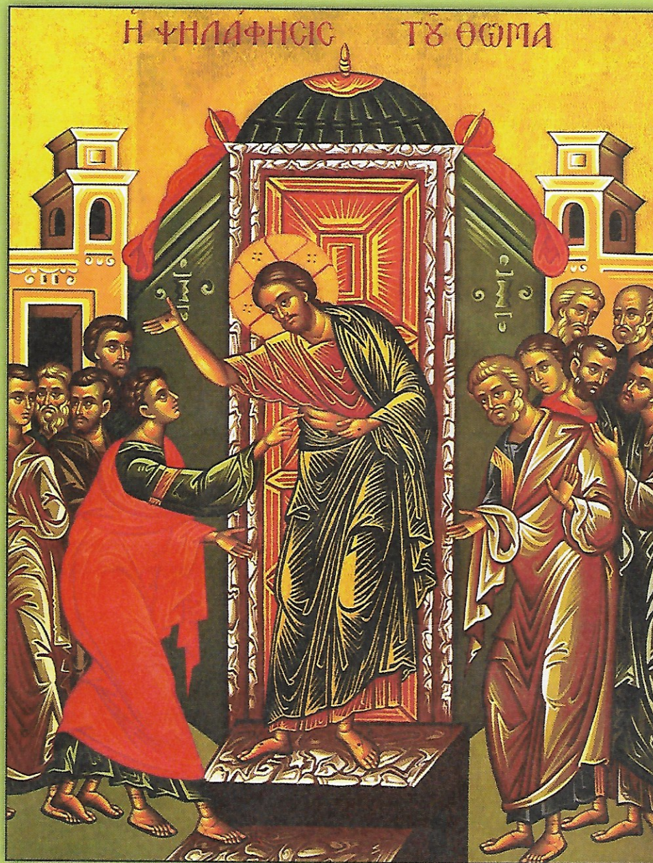
Icon of Christ and Saint Thomas