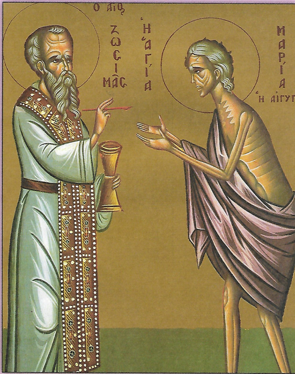
Icon of Saint Mary and Father Zozimos