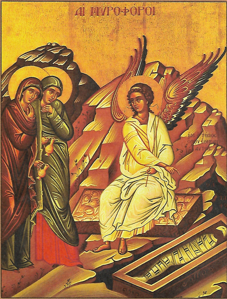
Icon of the Myrrh-bearing Women