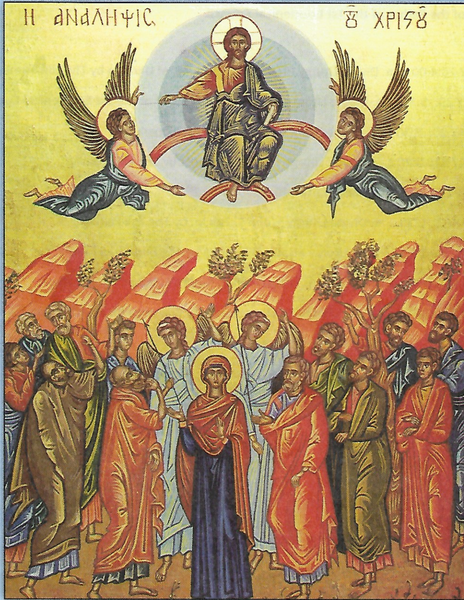
Icon of the Fathers of the First Ecumenical Council