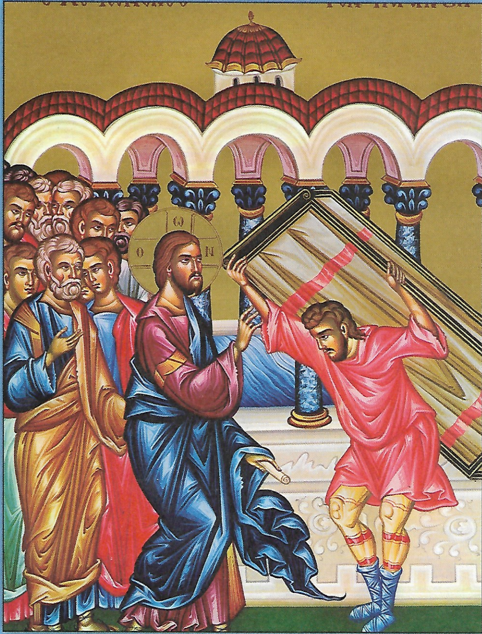
Icon of the Paralytic Man