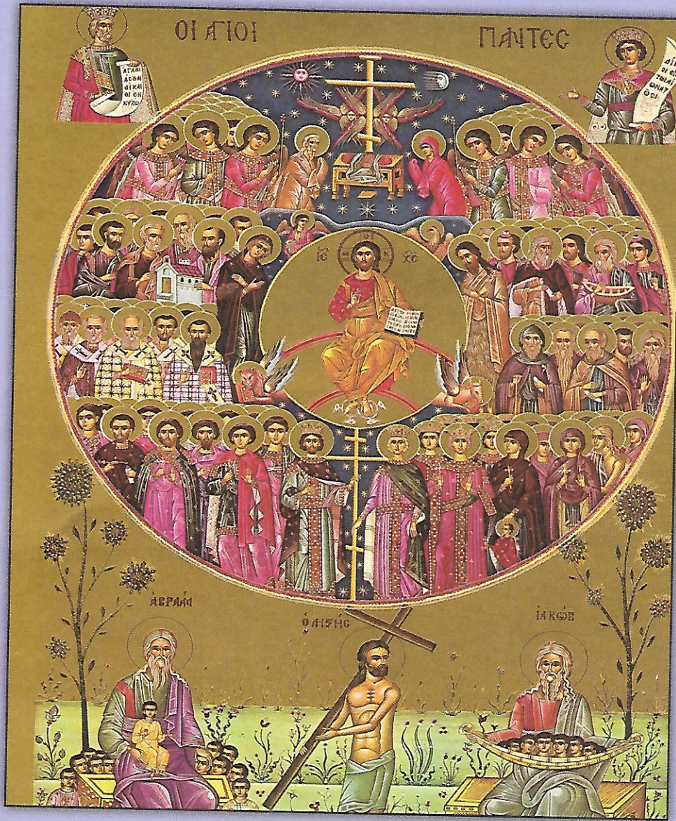
Icon of All Saints