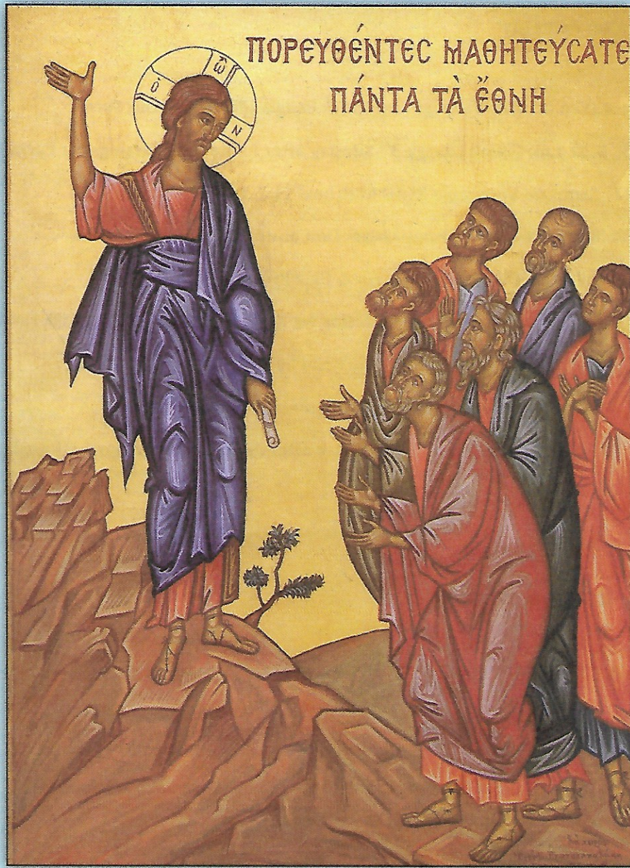
Icon of Jesus preaching to His Disciples