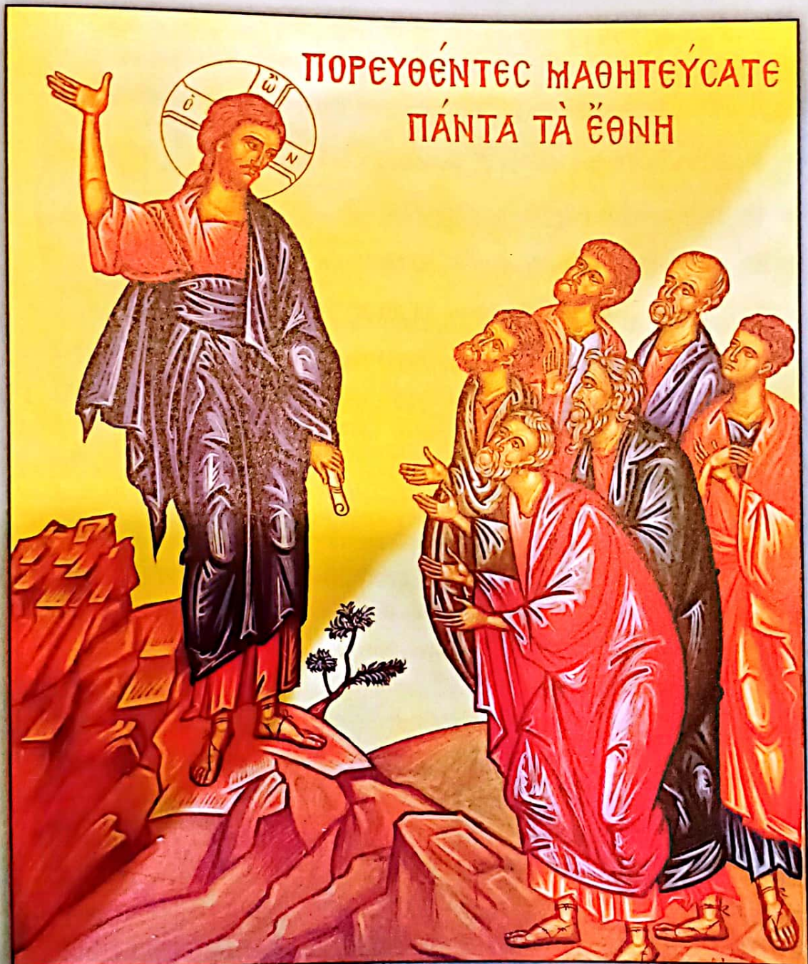
Icon of Christ Preaching to the Apostles