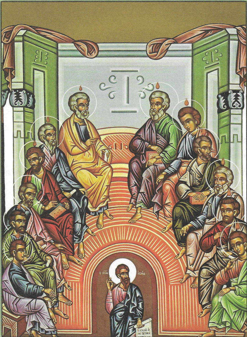
Icon of Pentecost