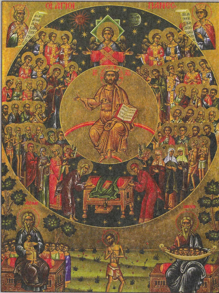
Icon of All Saints