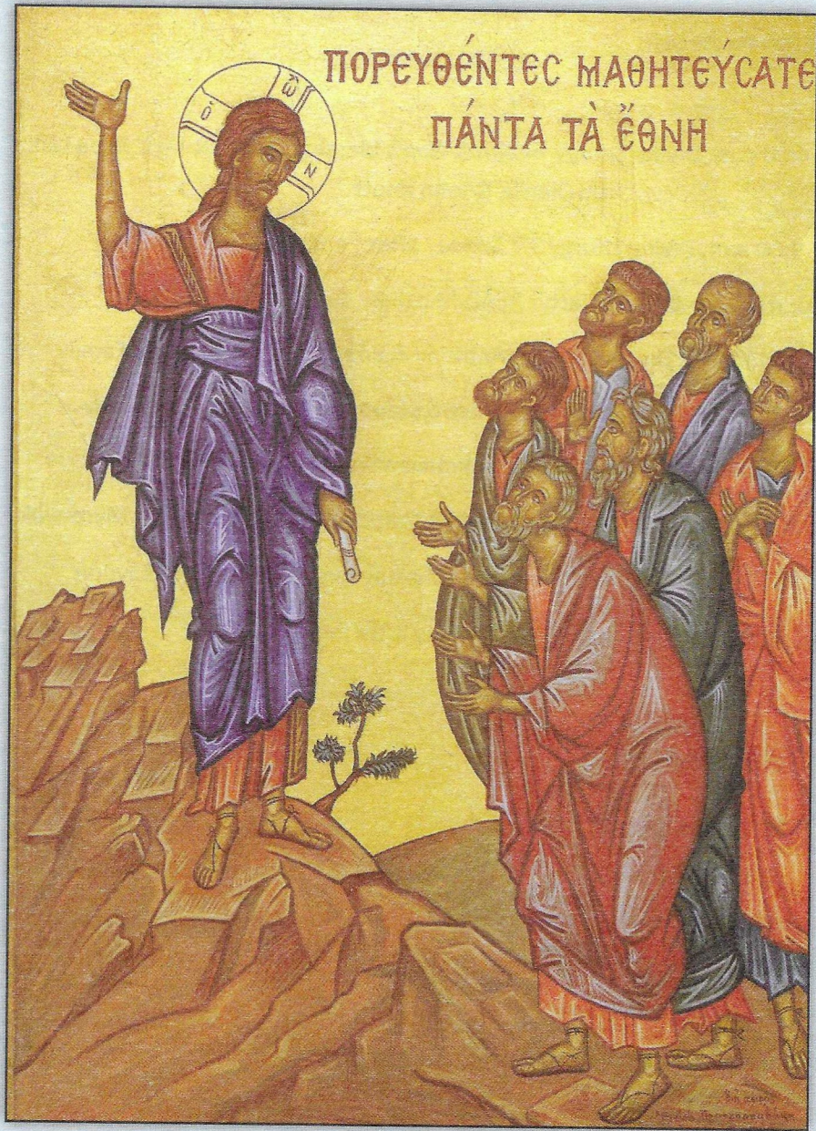
Icon of Jesus preaching to His Disciples