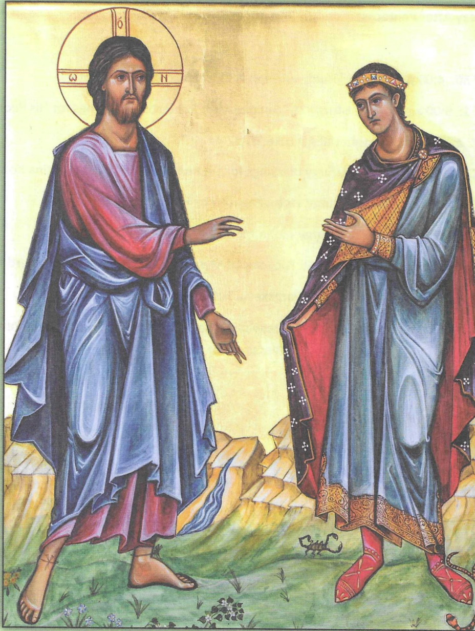
Icon of the Rich Young Ruler and Christ (Luke 18:18-27)