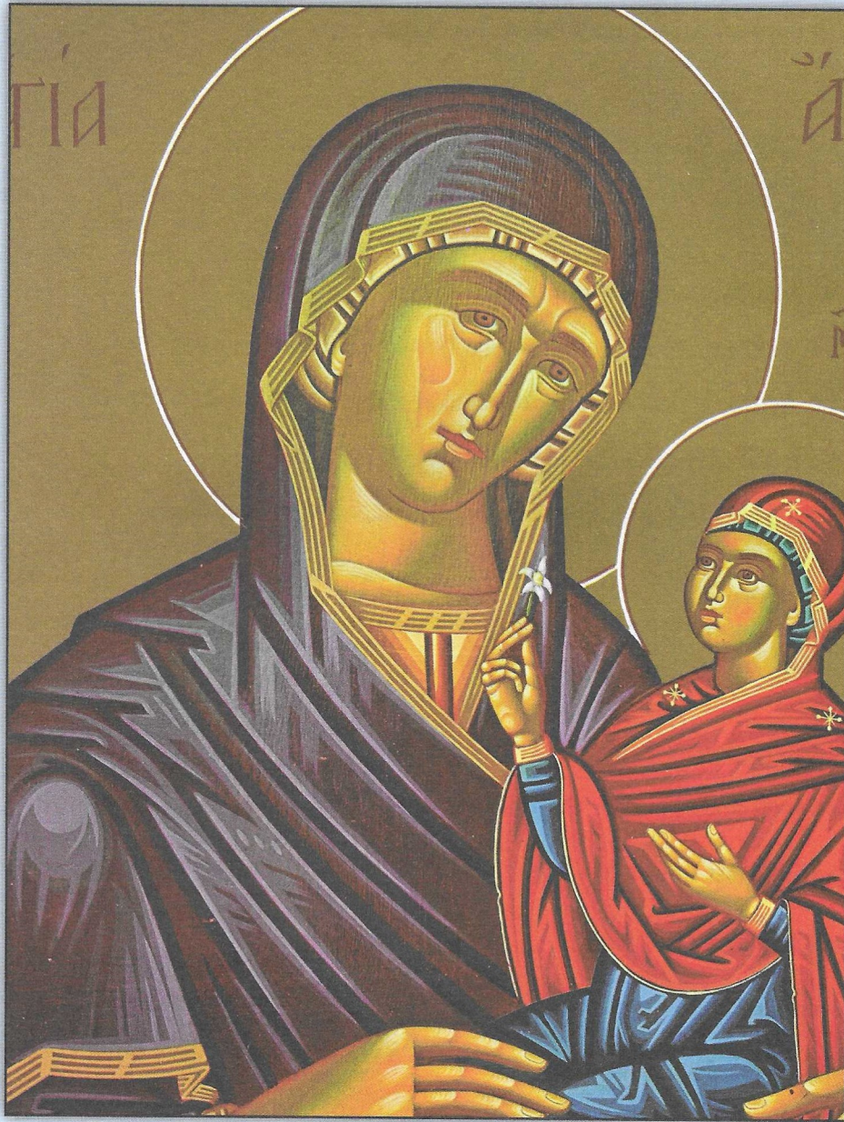
Icon of Saint Anna and the Mother of God